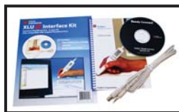
Computer Interface Kit - connects to any Windows™ application