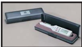
Hard Plastic Protective Case - protect your investment